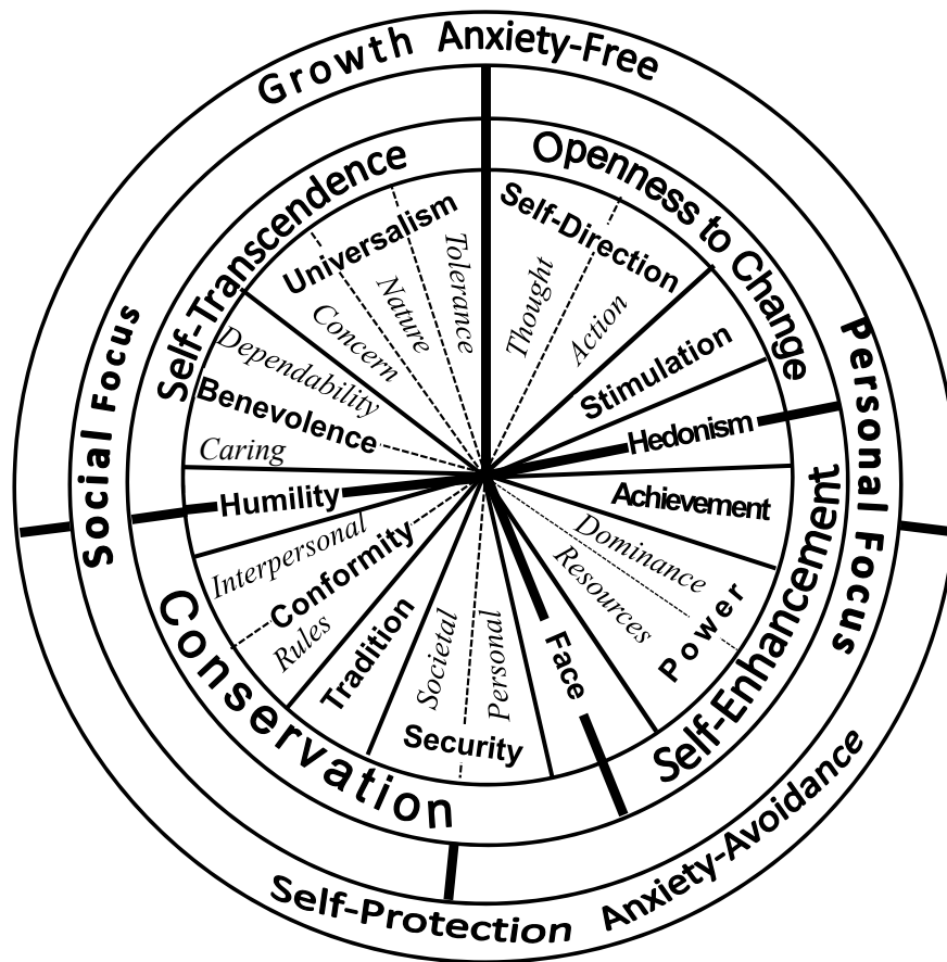
Figure 1. Proposed circular motivational continuum of 19 values with sources that underlie their order.